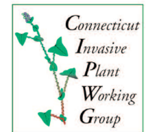
Saturday, May 21