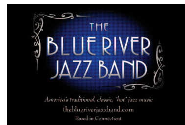
The Blue River Jazz Band