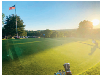
Wampanoag Country Club

As a reminder, the annual SCF golf tournament is back on for 2021, and registration is now available on the Seabury and SCF website by accessing www.seaburylife.org/golf for more information. If you are interested in golfing, sponsoring, donating to the silent auction, or just want to