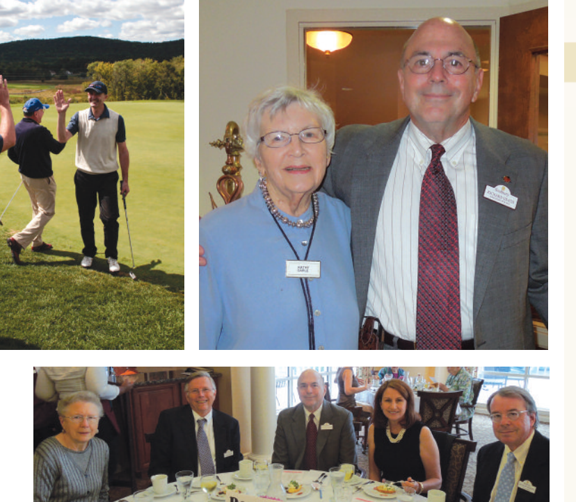
Seabury Charitable Foundation Board members enjoy the Foundation's "Sweet 16" celebration