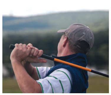
Teeing off at the 9th Annual Seabury Charitable Foundation Golf Tournament