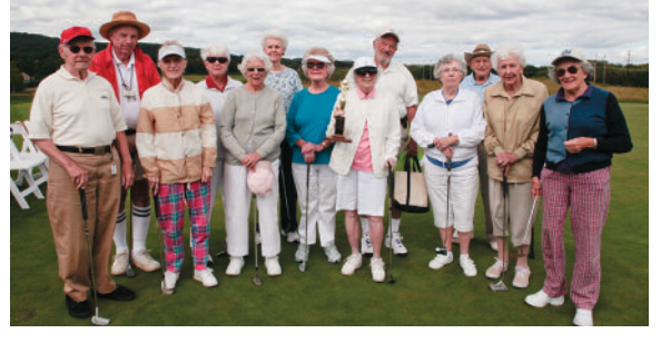
Residents ready for the putting contest